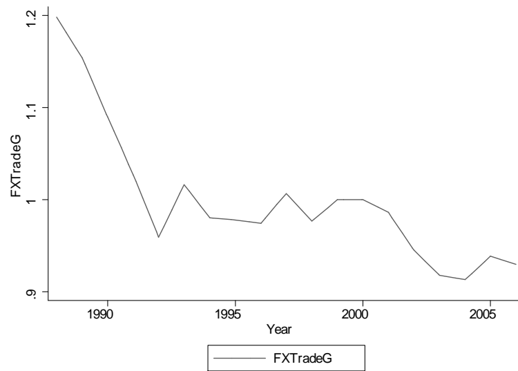
Figure 2: Real effective exchange rate

the computations for a set of alternative effective exchange rates indexes for the Portuguese economy in the period 1988-2006. The results in that paper suggest that the choice of bilateral weights does not make much difference. The set of countries included in exchange rate indexes originates more variation but produces similar trends. A more important issue is whether to use aggregate or sector-specific exchange rates.