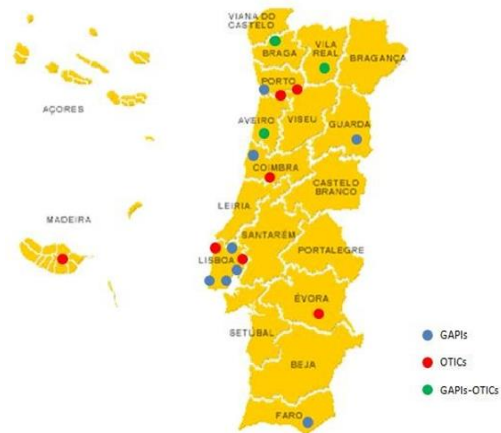
Figure 2: Regional location of TTOs